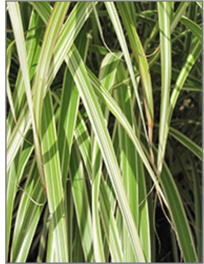
Morning Light Maiden Grass foliage

This plant does best in full sun to partial shade. It prefers to grow in average to moist conditions, and shouldn't be allowed to dry out. It is not particular as to soil type or pH. It is highly tolerant of urban pollution and will even thrive in inner city environments. This is a selected variety of a species not originally from North America. It can be propagated by division; however, as a cultivated variety, be aware that it may be subject to certain restrictions or prohibitions on propagation.