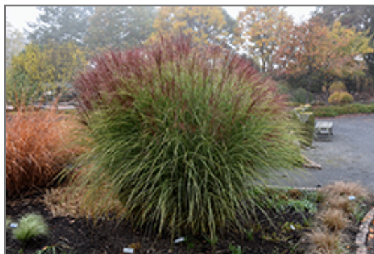
Morning Light Maiden Grass fruit

Morning Light Maiden Grass is recommended for the following landscape applications;