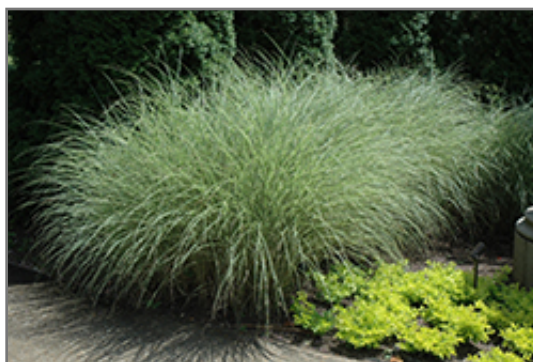
Morning Light Maiden Grass