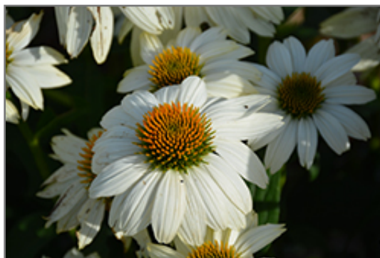
PowWow White Coneflower flowers

This is a relatively low maintenance plant, and is best cleaned up in early spring before it resumes active growth for the season. It is a good choice for attracting birds and butterflies to your yard, but is not particularly attractive to deer who tend to leave it alone in favor of tastier treats. It has no significant negative characteristics.