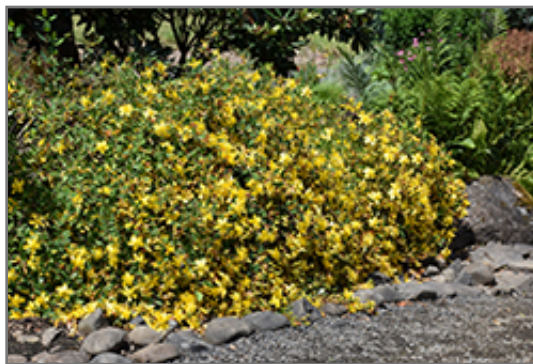
Hidcote St. John's Wort in bloom