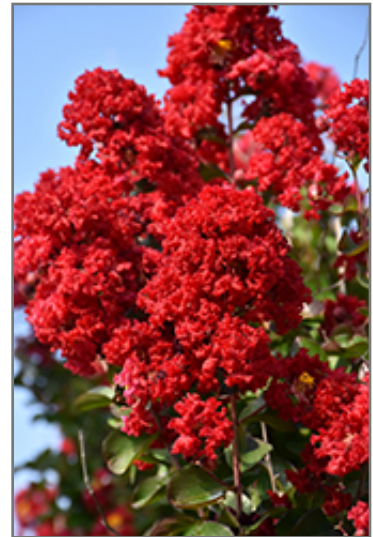
Dynamite Crapemyrtle flowers