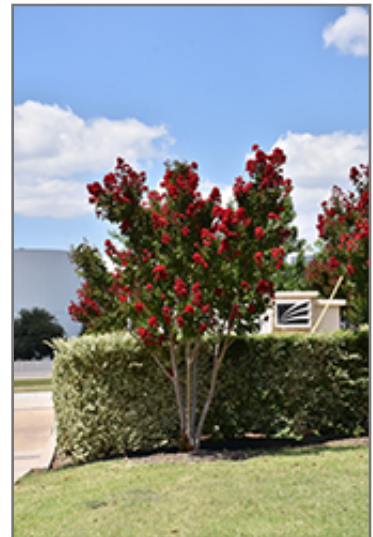
Dynamite Crapemyrtle in bloom