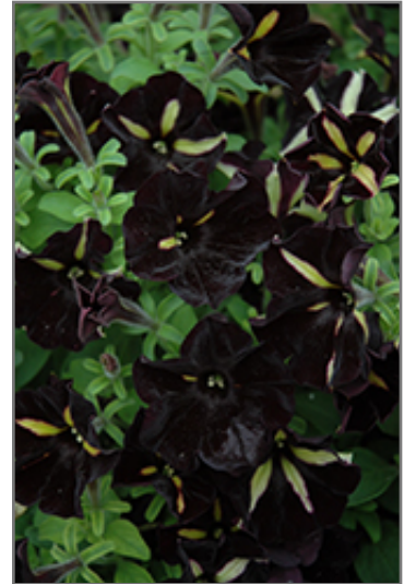
Phantom Petunia flowers