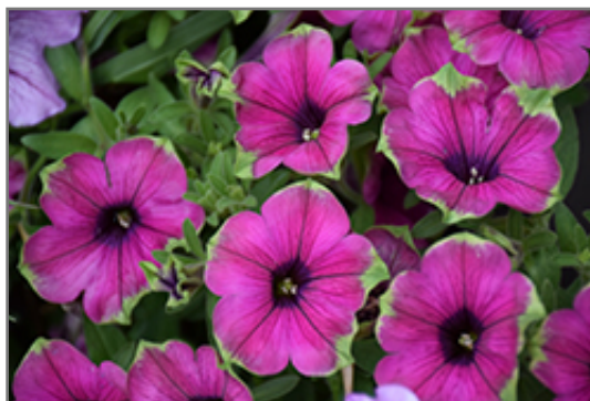
Supertunia Pretty Much Picasso Petunia flowers