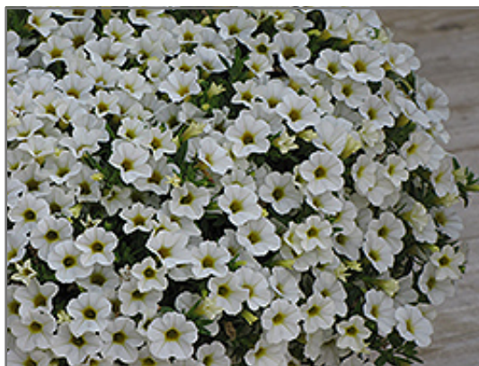
Cabaret White Calibrachoa flowers