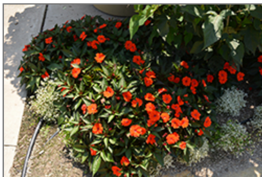
SunPatiens Compact Orange New Guinea Impatiens in bloom

SunPatiens Compact Orange New Guinea Impatiens will grow to be about 24 inches tall at maturity, with a spread of 24 inches. When grown in masses or used as a bedding plant, individual plants should be spaced approximately 20 inches apart. Its foliage tends to remain dense right to the ground, not requiring facer plants in front. This fast-growing annual will normally live for one full growing season, needing replacement the following year.