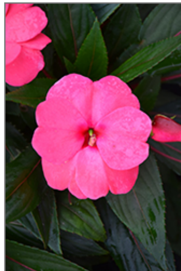
Sonic Pink New Guinea Impatiens flowers

Sonic Pink New Guinea Impatiens is recommended for the following landscape applications;