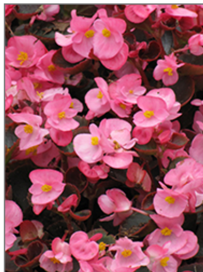
Bada Boom Pink Begonia flowers