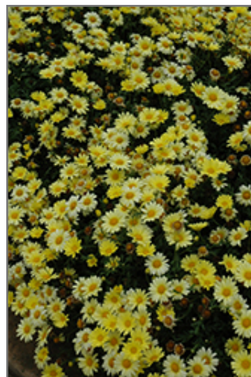
Butterfly Marguerite Daisy flowers