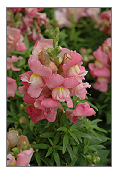
Snapshot Pink Snapdragon flowers

60 N. Gore Ave. Webster Groves, MO 63119 p: (314) 962-3311 w: rollingridgenursery.com