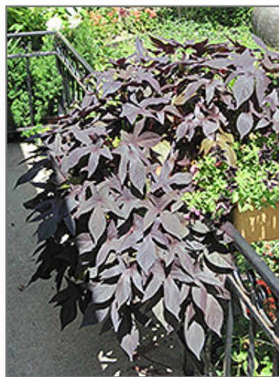
Proven Accents Blackie Sweet Potato Vine