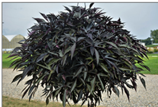
Illusion Midnight Lace Sweet Potato Vine