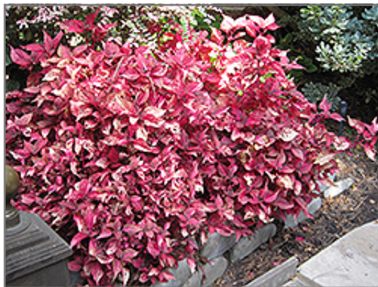
Blood Leaf