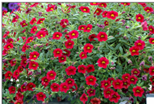
MiniFamous Compact Dark Red Calibrachoa flowers

MiniFamous Compact Dark Red Calibrachoa is recommended for the following landscape applications;