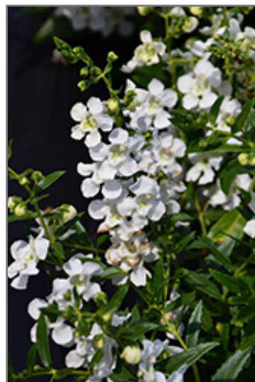
AngelMist Spreading White Angelonia flowers

This plant will require occasional maintenance and upkeep, and should not require much pruning, except when necessary, such as to remove dieback. It is a good choice for attracting butterflies to your yard, but is not particularly attractive to deer who tend to leave it alone in favor of tastier treats. It has no significant negative characteristics.