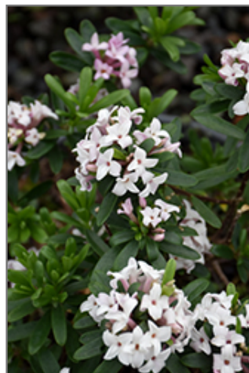
Eternal Fragrance Daphne flowers