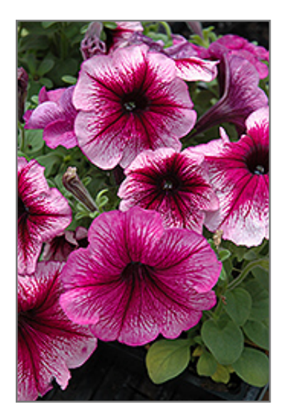
Madness Sugar Petunia flowers

60 N. Gore Ave. Webster Groves, MO 63119 p: (314) 962-3311 w: rollingridgenursery.com