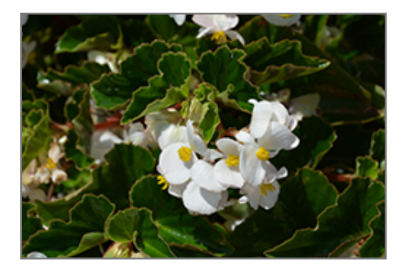
BabyWing White Begonia flowers

60 N. Gore Ave. Webster Groves, MO 63119 p: (314) 962-3311 w: rollingridgenursery.com