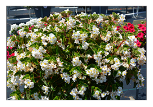
BabyWing White Begonia in bloom