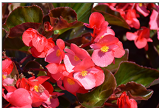
Whopper Rose Bronze Leaf Begonia flowers