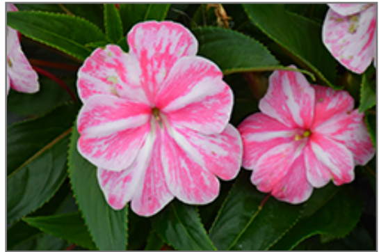
Sonic Magic Pink New Guinea Impatiens flowers

Sonic Magic Pink New Guinea Impatiens is recommended for the following landscape applications;