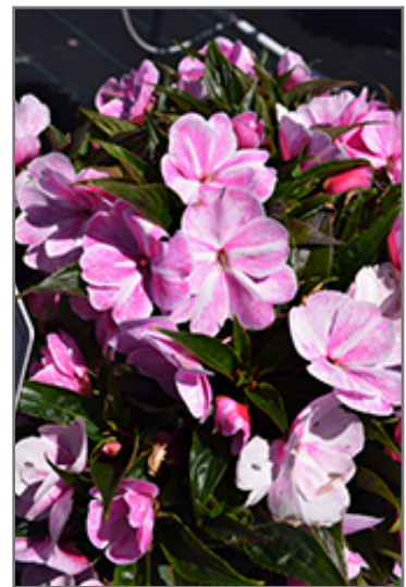
Sonic Magic Pink New Guinea Impatiens flowers