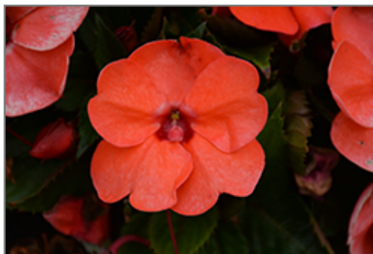
SunPatiens Compact Hot Coral New Guinea Impatiens flowers

This plant will require occasional maintenance and upkeep, and should not require much pruning, except when necessary, such as to remove dieback. It is a good choice for attracting bees and butterflies to your yard. It has no significant negative characteristics.