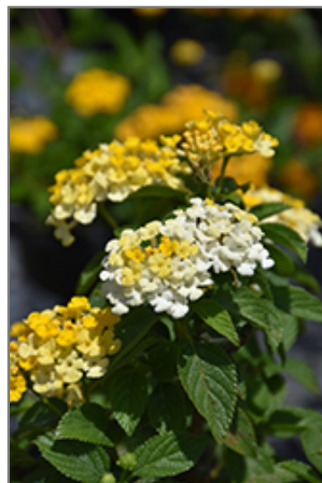
Bandana Lemon Zest Lantana flowers