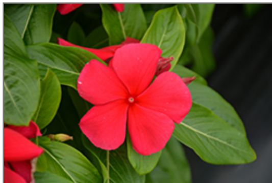
Titan Dark Red Vinca flowers

Titan Dark Red Vinca is recommended for the following landscape applications;