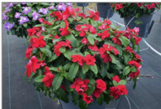
Titan Dark Red Vinca in bloom

Titan Dark Red Vinca will grow to be about 14 inches tall at maturity, with a spread of 12 inches. Its foliage tends to remain dense right to the ground, not requiring facer plants in front. Although it's not a true annual, this fast-growing plant can be expected to behave as an annual in our climate if left outdoors over the winter, usually needing replacement the following year. As such, gardeners should take into consideration that it will perform differently than it would in its native habitat.