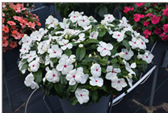
Titan Polka Dot Vinca flowers

Titan Polka Dot Vinca will grow to be about 14 inches tall at maturity, with a spread of 12 inches. Its foliage tends to remain dense right to the ground, not requiring facer plants in front. Although it's not a true annual, this fast-growing plant can be expected to behave as an annual in our climate if left outdoors over the winter, usually needing replacement the following year. As such, gardeners should take into consideration that it will perform differently than it would in its native habitat.