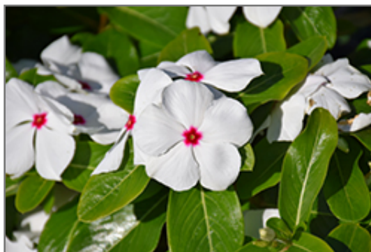
Titan Polka Dot Vinca flowers

Titan Polka Dot Vinca is recommended for the following landscape applications;