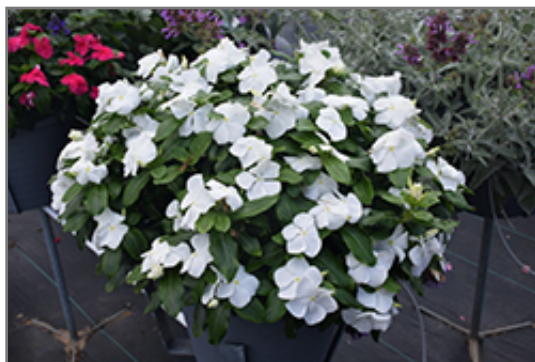
Titan Pure White Vinca in bloom

Titan Pure White Vinca will grow to be about 14 inches tall at maturity, with a spread of 12 inches. Its foliage tends to remain dense right to the ground, not requiring facer plants in front. Although it's not a true annual, this fast-growing plant can be expected to behave as an annual in our climate if left outdoors over the winter, usually needing replacement the following year. As such, gardeners should take into consideration that it will perform differently than it would in its native habitat.