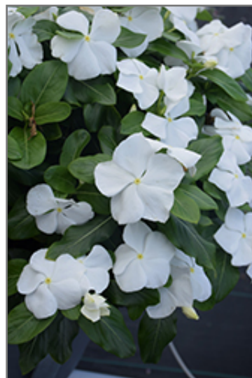
Titan Pure White Vinca flowers

Titan Pure White Vinca is recommended for the following landscape applications;