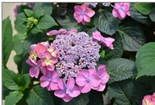
Tuff Stuff Hydrangea flowers

Tuff Stuff Hydrangea makes a fine choice for the outdoor landscape, but it is also well-suited for use in outdoor pots and containers. With its upright habit of growth, it is best suited for use as a 'thriller' in the 'spiller-thriller-filler' container combination; plant it near the center of the pot, surrounded by smaller plants and those that spill over the edges. It is even sizeable enough that it can be grown alone in a suitable container. Note that when grown in a container, it may not perform exactly as indicated on the tag - this is to be expected. Also note that when growing plants in outdoor containers and baskets, they may require more frequent waterings than they would in the yard or garden.