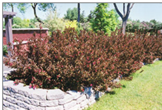
Wine and Roses Weigela