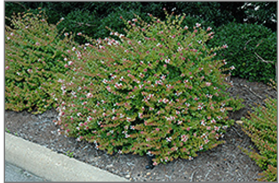
Rose Creek Abelia in bloom

Rose Creek Abelia is recommended for the following landscape applications;