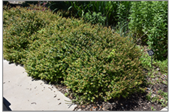
Rose Creek Abelia

Rose Creek Abelia makes a fine choice for the outdoor landscape, but it is also well-suited for use in outdoor pots and containers. Because of its height, it is often used as a 'thriller' in the 'spiller-thriller-filler' container combination; plant it near the center of the pot, surrounded by smaller plants and those that spill over the edges. It is even sizeable enough that it can be grown alone in a suitable container. Note that when grown in a container, it may not perform exactly as indicated on the tag - this is to be expected. Also note that when growing plants in outdoor containers and baskets, they may require more frequent waterings than they would in the yard or garden.