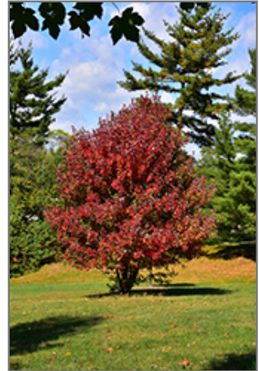
Redpointe Red Maple in fall

This tree should only be grown in full sunlight. It is quite adaptable, preferring to grow in average to wet conditions, and will even tolerate some standing water. It is not particular as to soil type, but has a definite preference for acidic soils, and is subject to chlorosis (yellowing) of the foliage in alkaline soils. It is somewhat tolerant of urban pollution. This is a selection of a native North American species.