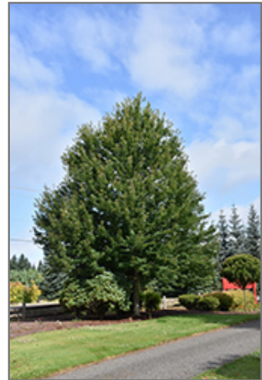
Redpointe Red Maple