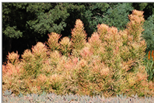
Sticks On Fire Red Pencil Tree