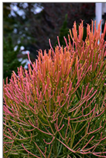
Sticks On Fire Red Pencil Tree foliage

Sticks On Fire Red Pencil Tree is recommended for the following landscape applications;