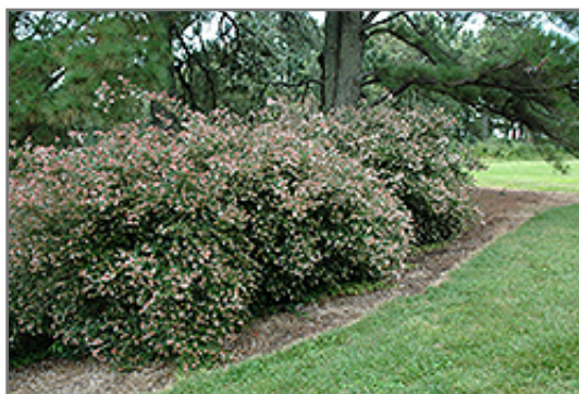
Glossy Abelia in bloom