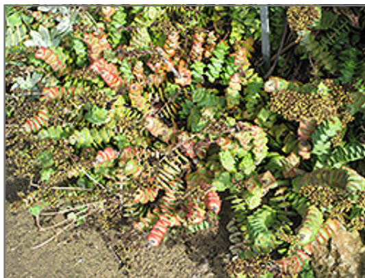
String Of Buttons

String Of Buttons is recommended for the following landscape applications;