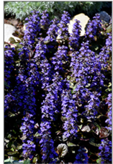
Mahogany Bugleweed flowers

This plant does best in partial shade to shade. It does best in average to evenly moist conditions, but will not tolerate standing water. It is not particular as to soil type or pH. It is somewhat tolerant of urban pollution. Consider covering it with a thick layer of mulch in winter to protect it in exposed locations or colder microclimates. This is a selected variety of a species not originally from North America. It can be propagated by division; however, as a cultivated variety, be aware that it may be subject to certain restrictions or prohibitions on propagation.