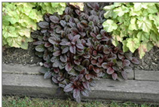
Mahogany Bugleweed