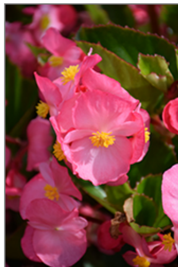
Big Pink Green Leaf Begonia flowers

This is a high maintenance plant that will require regular care and upkeep, and usually looks its best without pruning, although it will tolerate pruning. Deer don't particularly care for this plant and will usually leave it alone in favor of tastier treats. Gardeners should be aware of the following characteristic(s) that may warrant special consideration;