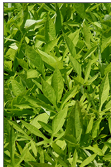
SolarPower Lime Sweet Potato Vine foliage