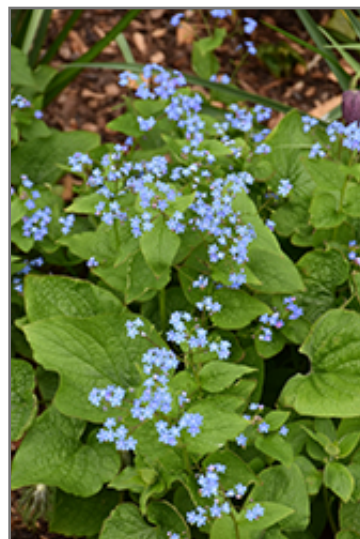
Siberian Bugloss flowers