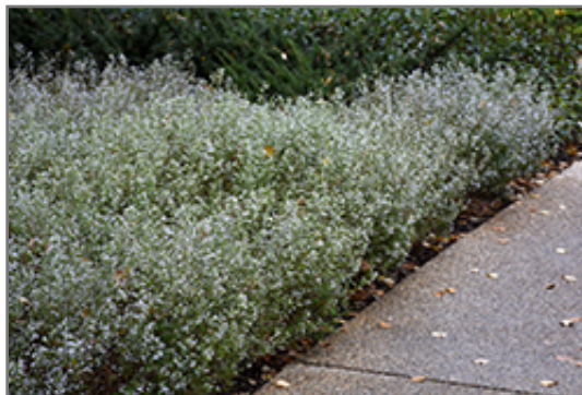
Dwarf Calamint in bloom

Dwarf Calamint is recommended for the following landscape applications;