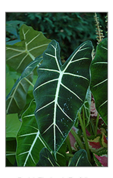
Frydek Elephant's Ear foliage

When grown indoors, Frydek Elephant's Ear can be expected to grow to be about 3 feet tall at maturity, with a spread of 3 feet. It grows at a medium rate, and under ideal conditions can be expected to live for approximately 5 years. This houseplant will do well in a location that gets either direct or indirect sunlight, although it will usually require a more brightly-lit environment than what artificial indoor lighting alone can provide. It is quite adaptable, prefering to grow in average to wet conditions, and will even tolerate some standing water. The surface of the soil should be kept consistently moist all of the time, and you should expect to water this plant two or more times each week, especially if it's growing in a low-humidity environment. Be aware that your particular watering schedule may vary depending on its location in the room, the pot size, plant size and other conditions; if in doubt, ask one of our experts in the store for advice. It is not particular as to soil type or pH; an average potting soil should work just fine. Be warned that parts of this plant are known to be toxic to humans and animals, so special care should be exercised if growing it around children and pets.