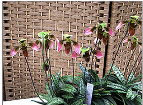
Appleton's Orchid in bloom