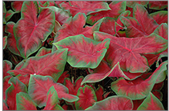
Frieda Hemple Caladium foliage