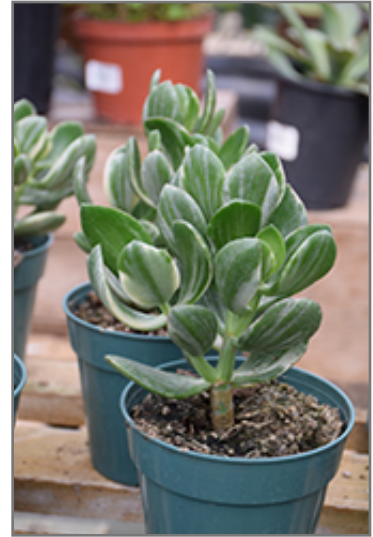
Variegated Jade Plant in full

This is a multi-stemmed evergreen houseplant with an upright spreading habit of growth. This plant can be pruned at any time to keep it looking its best.