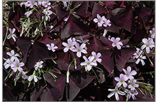
Purple Shamrock flowers