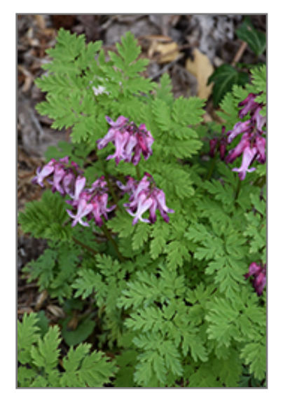
Bleeding Heart flowers