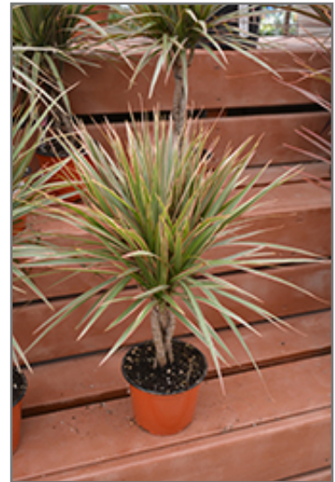
Colorama Dracaena in full

When grown indoors, Colorama Dracaena can be expected to grow to be about 3 feet tall at maturity, with a spread of 24 inches. It grows at a medium rate, and under ideal conditions can be expected to live for approximately 10 years. This houseplant performs well in both bright or indirect sunlight and strong artificial light, and can therefore be situated in almost any well-lit room or location. It does best in average to evenly moist soil, but will not tolerate standing water. The surface of the soil shouldn't be allowed to dry out completely, and so you should expect to water this plant once and possibly even twice each week. Be aware that your particular watering schedule may vary depending on its location in the room, the pot size, plant size and other conditions; if in doubt, ask one of our experts in the store for advice. It is not particular as to soil type or pH; an average potting soil should work just fine.