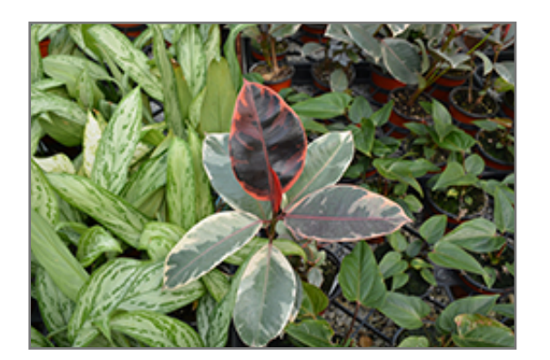
Tricolor Rubber Tree

When grown indoors, Tricolor Rubber Tree can be expected to grow to be about 10 feet tall at maturity, with a spread of 5 feet. It grows at a medium rate, and under ideal conditions can be expected to live for approximately 50 years. This houseplant will do well in a location that gets either direct or indirect sunlight, although it will usually require a more brightly-lit environment than what artificial indoor lighting alone can provide. It prefers dry to average moisture levels with very well-drained soil, and may die if left in standing water for any length of time. This plant should be watered when the surface of the soil gets dry, and will need watering approximately once each week. Be aware that your particular watering schedule may vary depending on its location in the room, the pot size, plant size and other conditions; if in doubt, ask one of our experts in the store for advice. It is not particular as to soil type or pH; an average potting soil should work just fine.