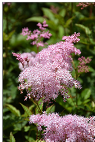
Queen Of The Prairie flowers