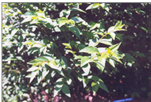
Common Privet foliage