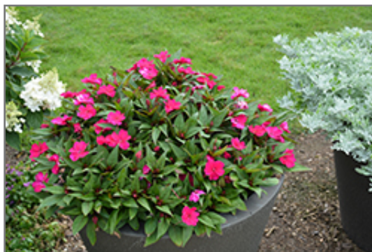
SunPatiens Compact Neon Pink New Guinea Impatiens in bloom

SunPatiens Compact Neon Pink New Guinea Impatiens will grow to be about 24 inches tall at maturity, with a spread of 24 inches. When grown in masses or used as a bedding plant, individual plants should be spaced approximately 20 inches apart. Its foliage tends to remain dense right to the ground, not requiring facer plants in front. This fast-growing annual will normally live for one full growing season, needing replacement the following year.