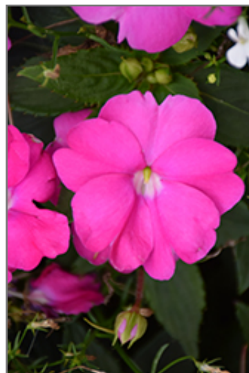
SunPatiens Compact Neon Pink New Guinea Impatiens flowers

This plant will require occasional maintenance and upkeep, and should not require much pruning, except when necessary, such as to remove dieback. It is a good choice for attracting bees and butterflies to your yard. It has no significant negative characteristics.